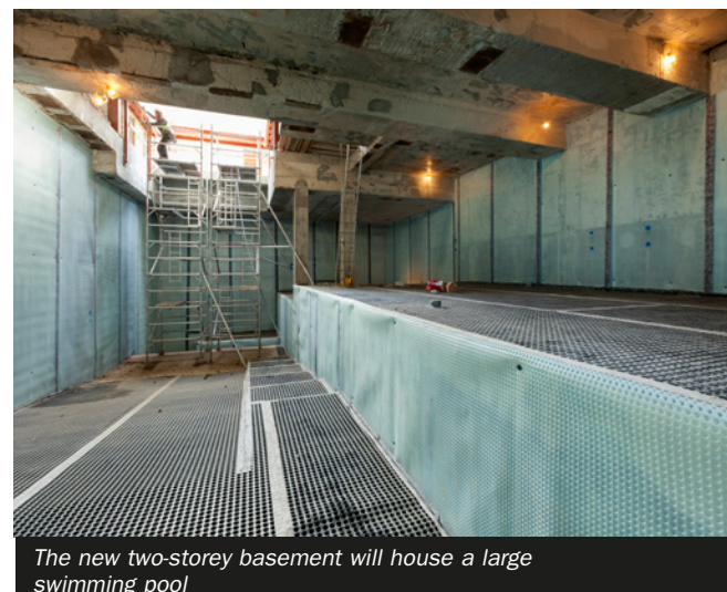
The new two-storey basement will house a large swimming pool