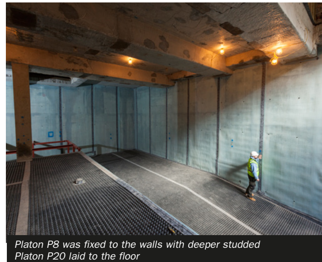
Platon P8 was fixed to the walls with deeper studded Platon P20 laid to the floor